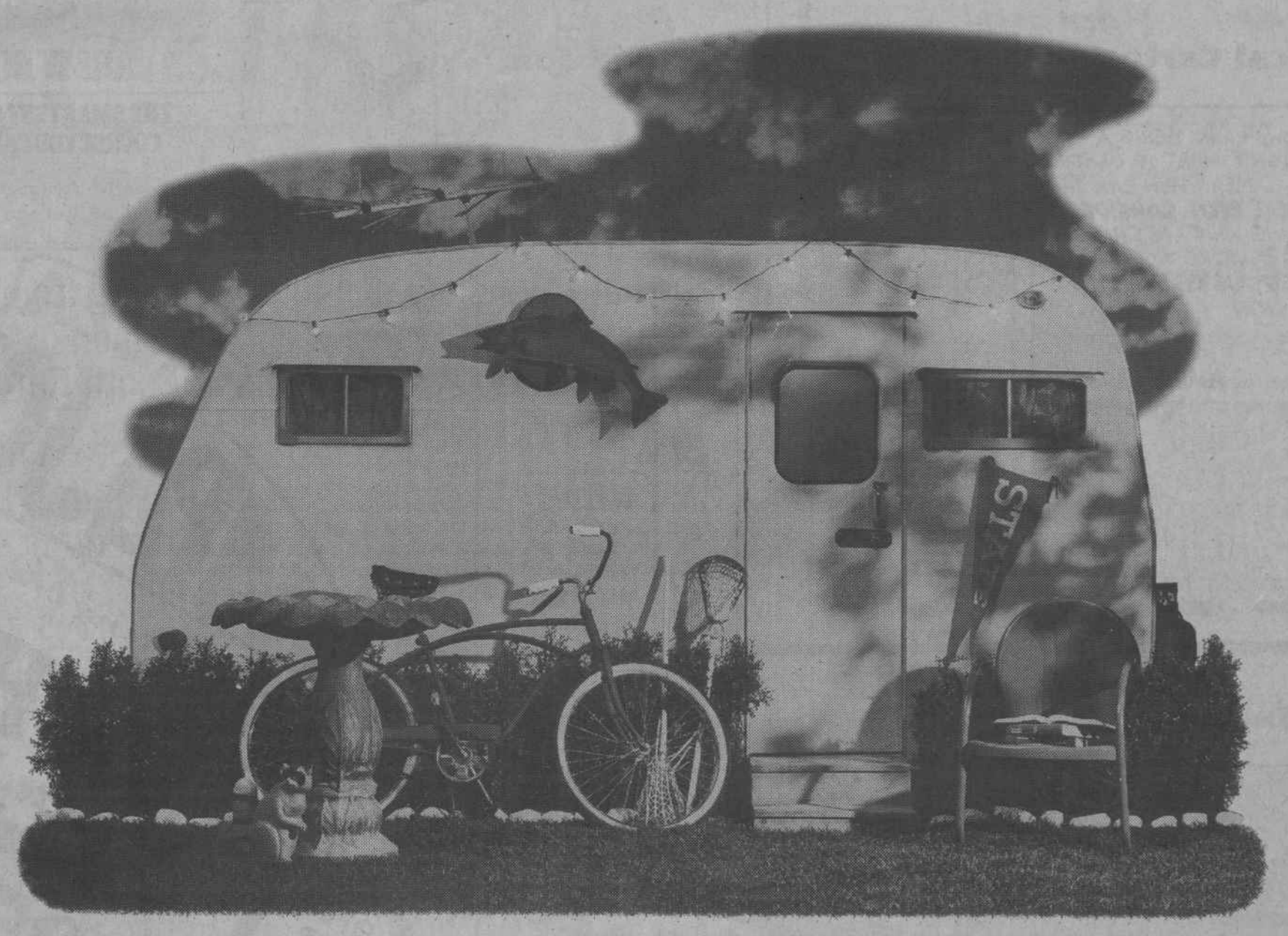
Choose AT&T and save up to 25%.

No matter where you choose to live, you can save money on your long distance phone bill with an AT&T Savings Option. It's all part of The i Plan .™ The personalized plan designed to fit the way you call.