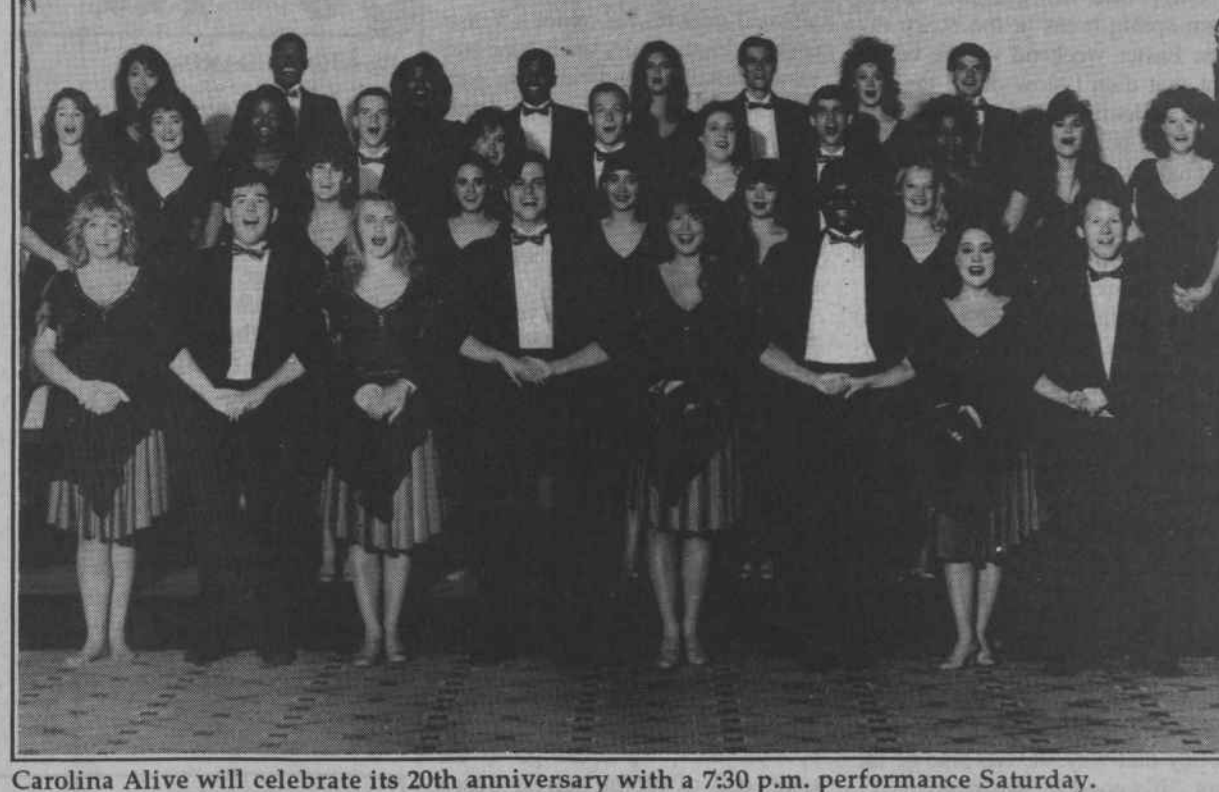
Carolina Alive will celebrate its 20th anniversary with a 7:30 p.m. performance Saturday.

"Not only has Carolina Alive entertained audiences around the world, they have also performed