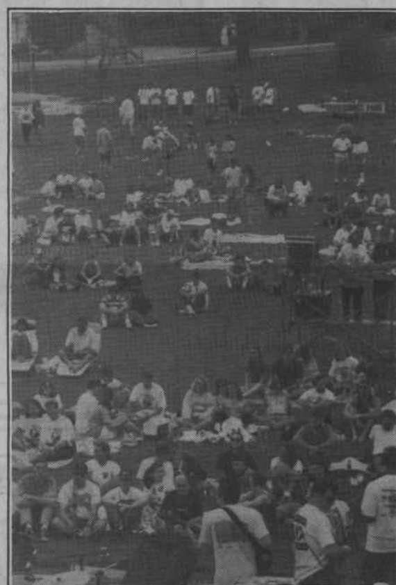
A relaxed crowd enjoys a day of sun and music provided by the Toasters at Cockstock.