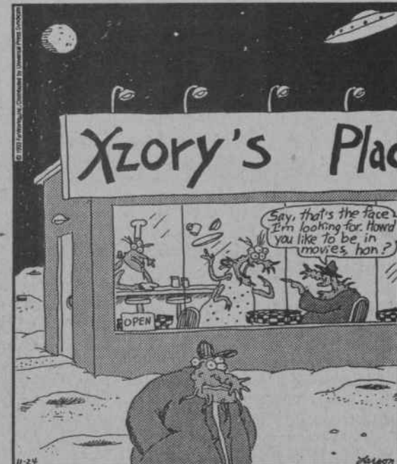
Alien corner cafes, where sometimes dreams do come true.