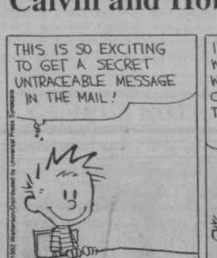
IT SAID A CODED LETTER WOULD FOLLOW! MAYBE IT WILL ARRIVE TODAY! I CAN'T WAIT TO GET HOME