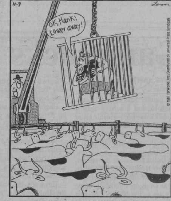
How cow documentaries are made