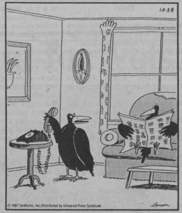
"Louis ... phonecaw."