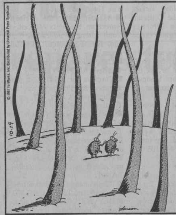
"Yes! Yes! That's it! ... Just a little higher."