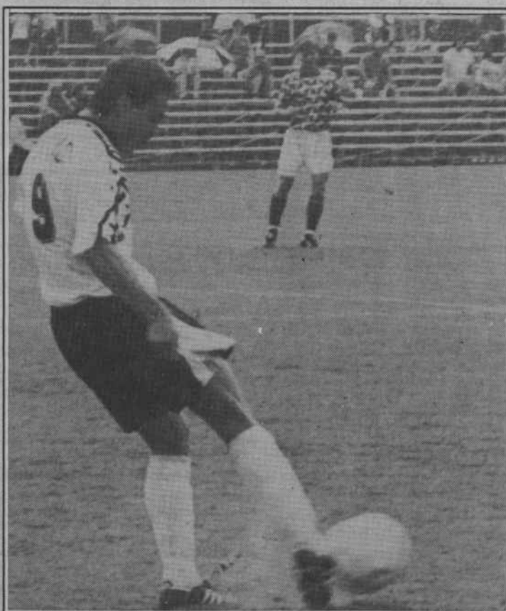
Lea Clayton/The Gamecock

The Eagles marched down the field and set up Walker's 9-yard touchdown run. After scoring the touchdown, Walker fake-spiked the ball in an uncharacteristic show of emotion.