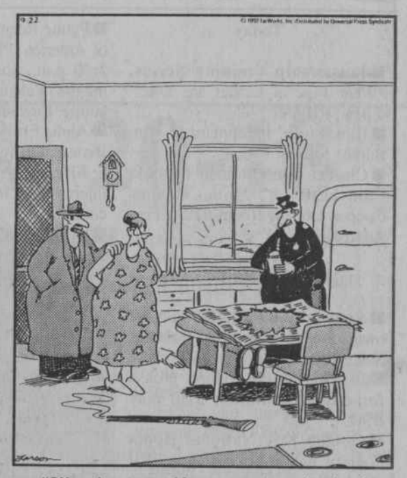
"OK, ma'am, you said you warned your husband to put the newspaper down or you'd blow him away... Did he respond?"