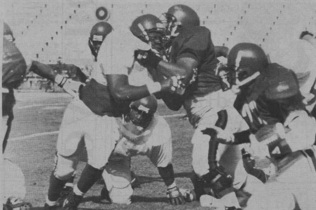
Mark Asmer/The Gamecock

The game is free for all students with IDs. In addition, students will be allotted the prime East Stand seats for viewing of the game.