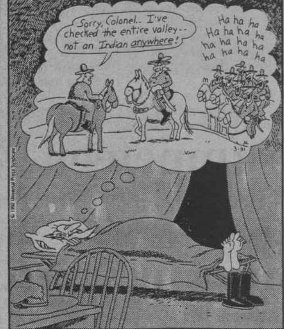
Custer's recurrent nightmare