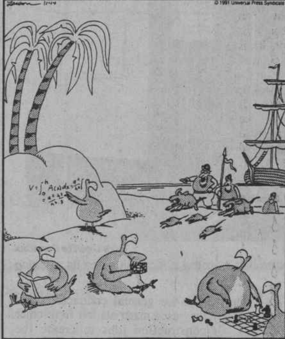
Unbeknownst to most ornithologists, the dodo was actually a very advanced species, living along quite peacefully until, in the 17th century, it was annihilated by men, rats and dogs. As usual.