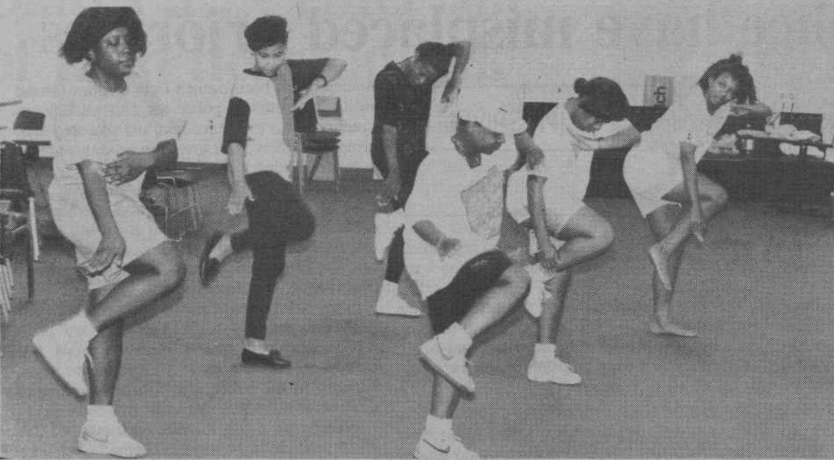
The Alpha Kappa Alpha sorority step team practices for Saturday's Step Show Extravaganza