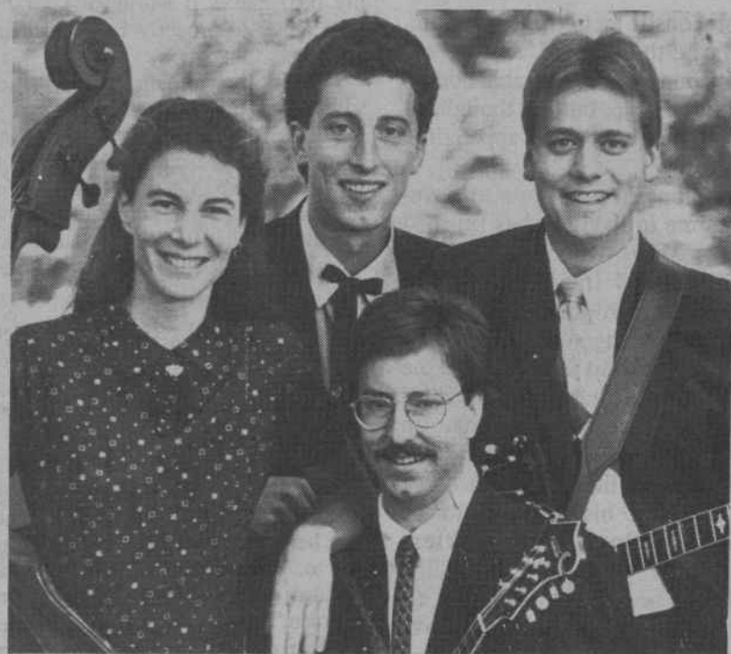
The Shady Grove Band will play at Autumnfest this weekend.

Under the shade of centuries of oaks and magnolias Columbians have welcomed fall amidst the aura of one of the city's favorite festivals, Autumnfest.