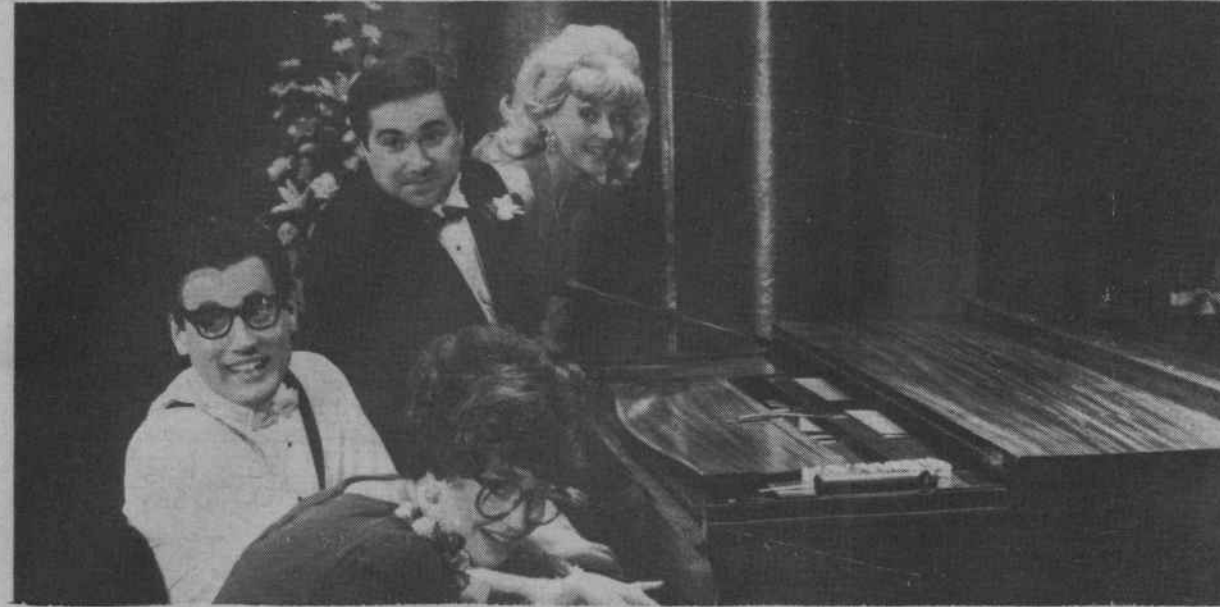
The cast of Oil City Symphony will appear at the Koger Center Sunday.