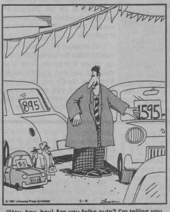
"Hey, hey, hey! Are you folks nuts? I'm telling you, this is the car for you!'