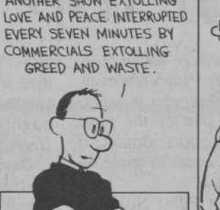
ANOTHER SHOW EXTOLLING EVERY SEVEN MINUTES BY COMMERCIALS EXTOLLING GREED AND WASTE