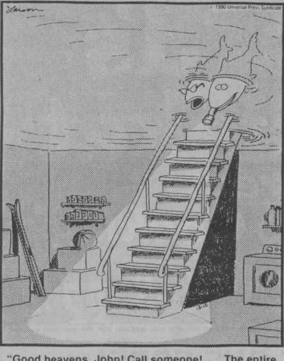
'Good heavens, John! Call someone! . . . The entire basement looks dry!"