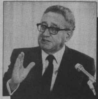
DR. HENRY A. KISSINGER Former U.S. Secretary of State

FOR MORE INFORMATION, CONTACT THE CAROLINA PROGRAM UNION 777-7130