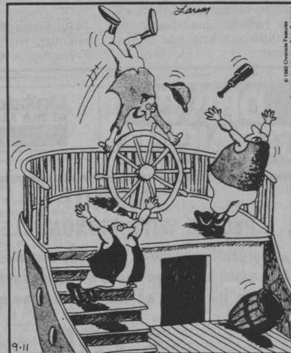
Columbus discovers America