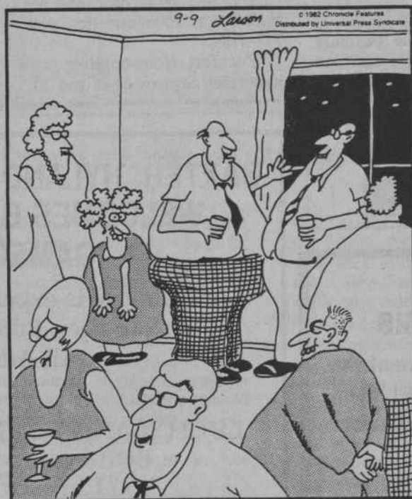
And then, from across the room, their eyes met.