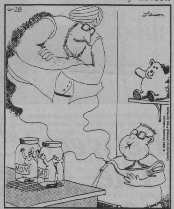
"Gee whiz .... You mean I get a THIRD wish, too?"