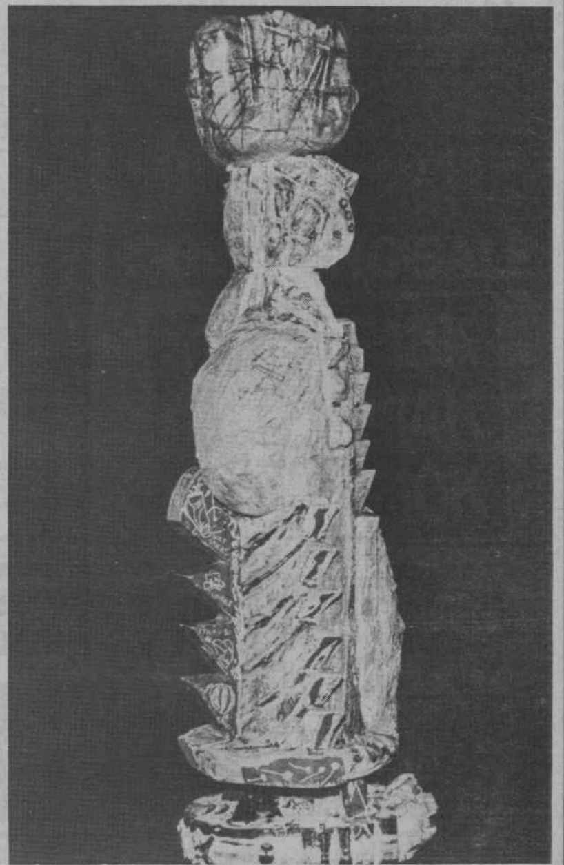
"Harry's Fault" by Megan Wolfe

The sculpture is on display at the McKissick Museum along with the rest of the show.