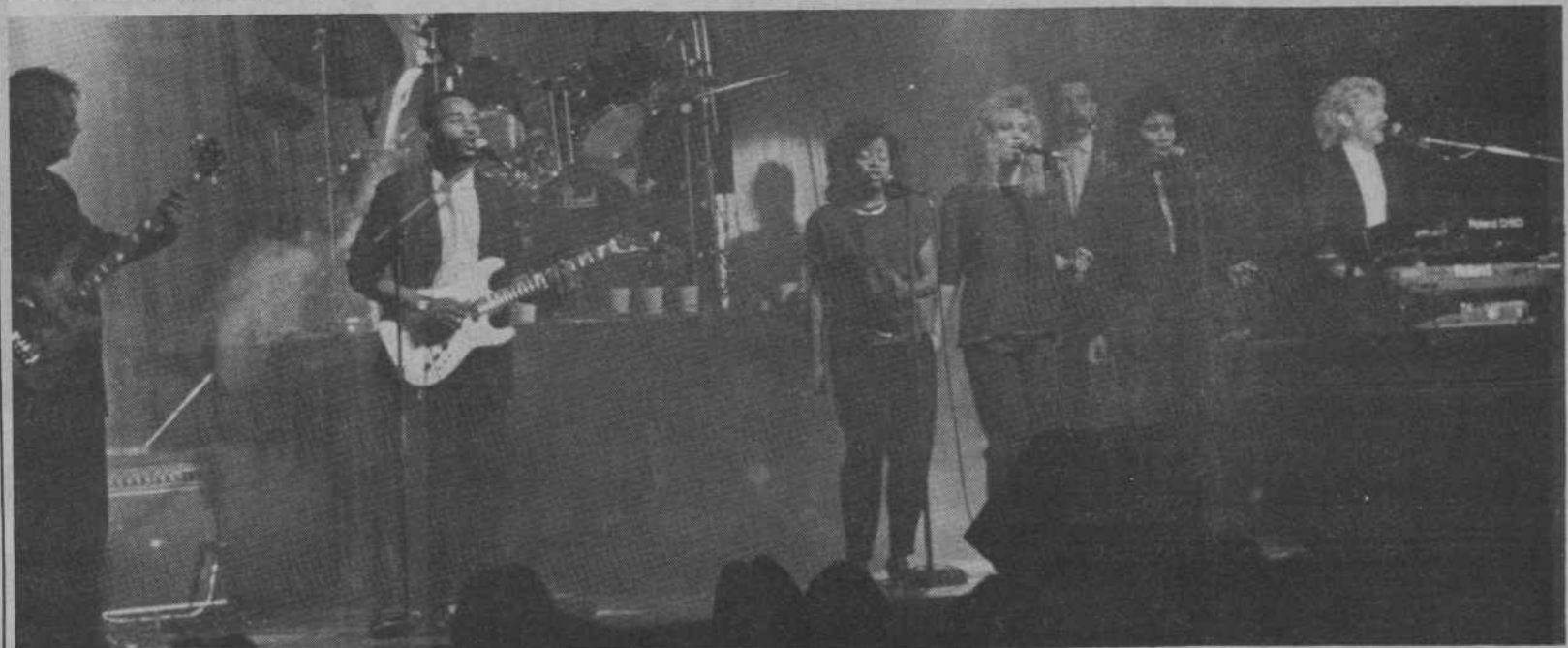
Two Thirty Eight played the Russell House Ballroom Sunday night. The Christian rock band from Atlanta played a mix of covers and originals, many from the recently released album Know That We Care . The free concert was sponsored by Campus Advance, a nondenominational campus organization affiliated with the Columbia Church of Christ.

Though Two Thirty Eight is an O.K. band in the religious field, they just didn't quite live up to all the pre-billing they received. Perhaps if the concert weren't free, it would not have been necessary to cut corners on such important measures as the P.A. system. A good live sound is, after all, important to a good live band.