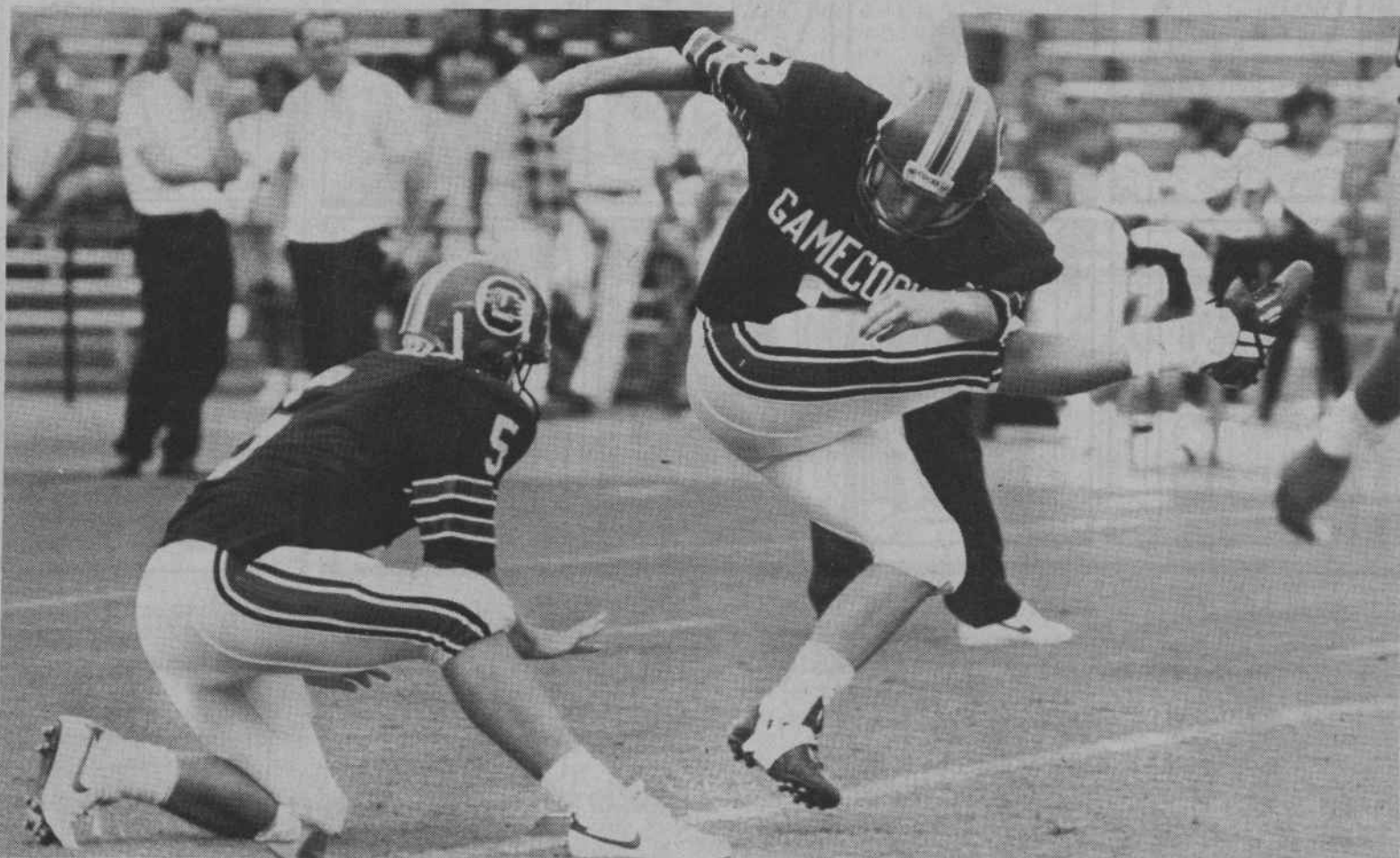
KENT BROOME/The Gamecock