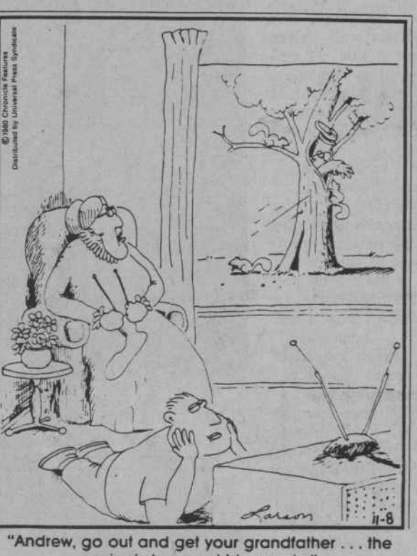
squirrels have got him again.'