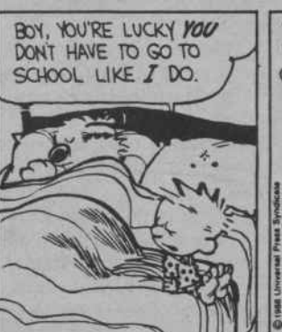
YOU DON'T KNOW WHAT IT'S LIKE TO GET UP ON THESE COLD, DARK MORNINGS AND HAVE TO GO SOMEPLACE