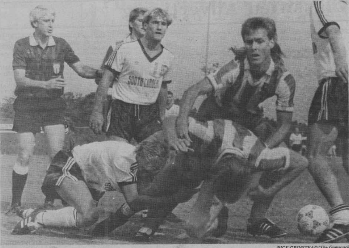
The action gets hot and heavy at The Graveyard during Monday's USC-Erskine soccer match.

Erskine's most serious scoring threat came with 19:55 remaining in