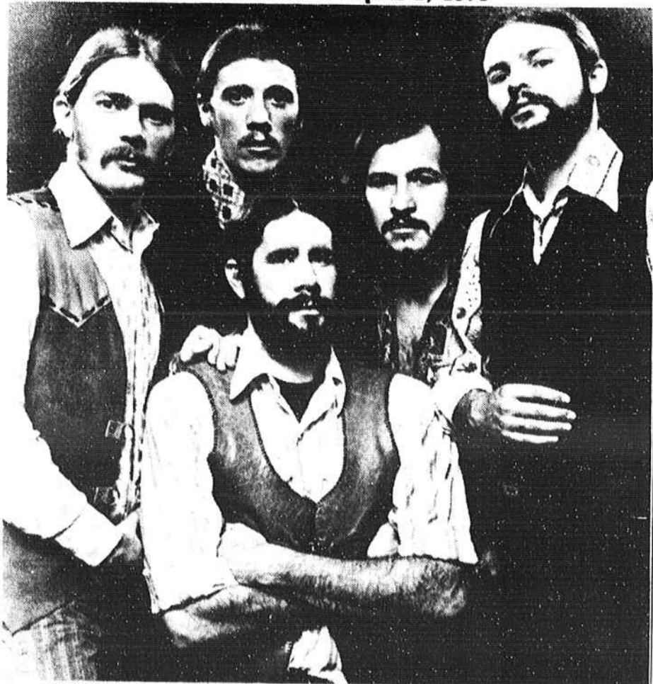
The Mission Mountain Wood Band.