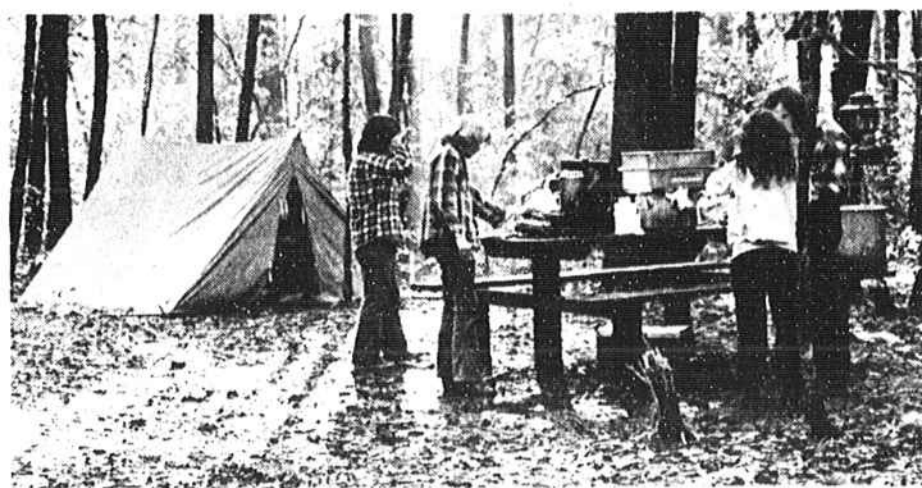
Participants in the University Union camping trip at Table Rock State Park are shown here cooking Sunday breakfast Oct. 30. The Union sponsors the trips every two weeks. The next trip is Nov. 10 to Hunting Island. Sign up by Tuesday, Nov. 7. The cost is $4 per person. Tents, food and transportation are provided.