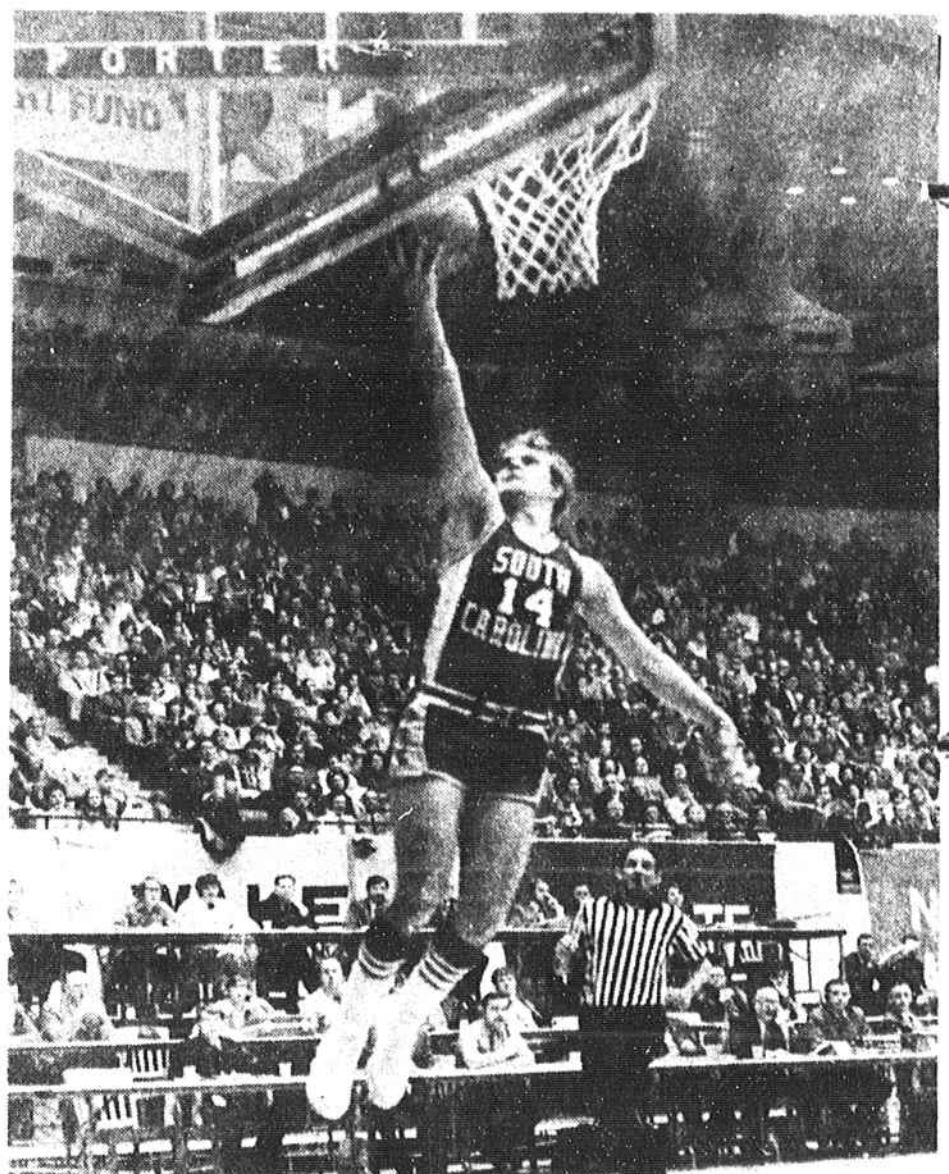
Laying it up

The Gamecocks' Florida trip is scheduled for the University's spring break from classes and will feature doubleheaders against the Yankee farm clubs on April 10 and 12 and possibly competition against other college teams in the area.