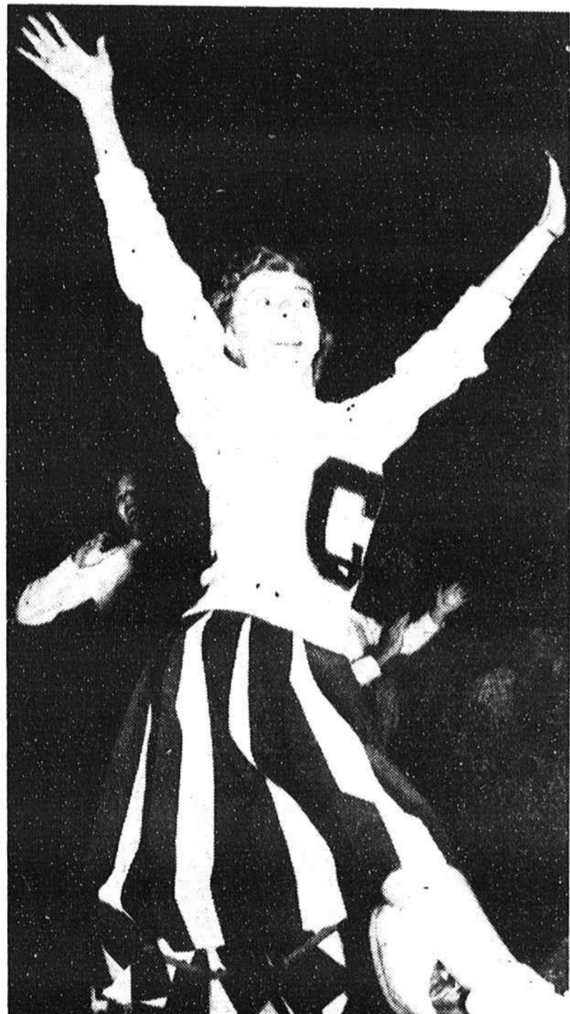
Whooping it up at the State House . . .