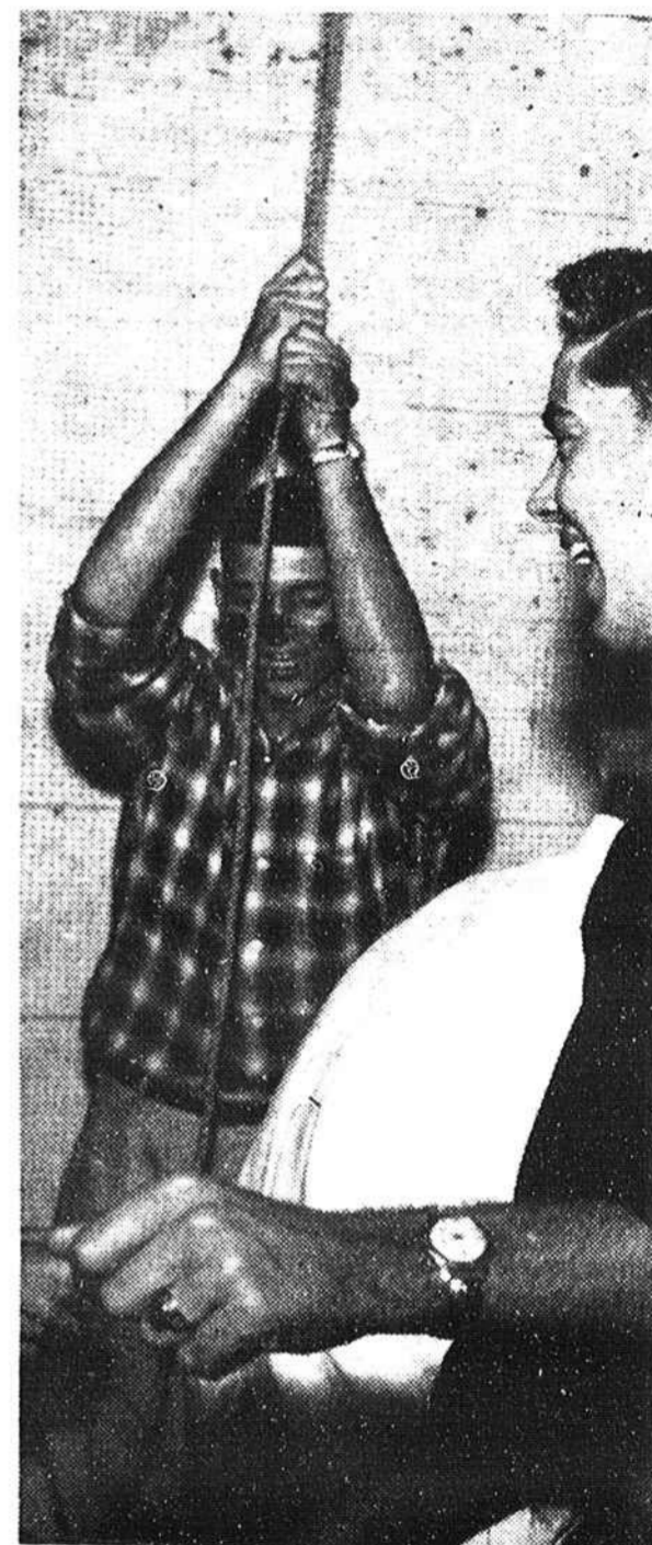
A little help from the hills . . .

And a part of the 35,000 fans that crowded into the stadium just across from the fair grounds left the stadium with a smile on their face and joy in their hearts, for their team had won, and the other part--well, they just left. But they will be back next year to see their team battle on Big Thursday.