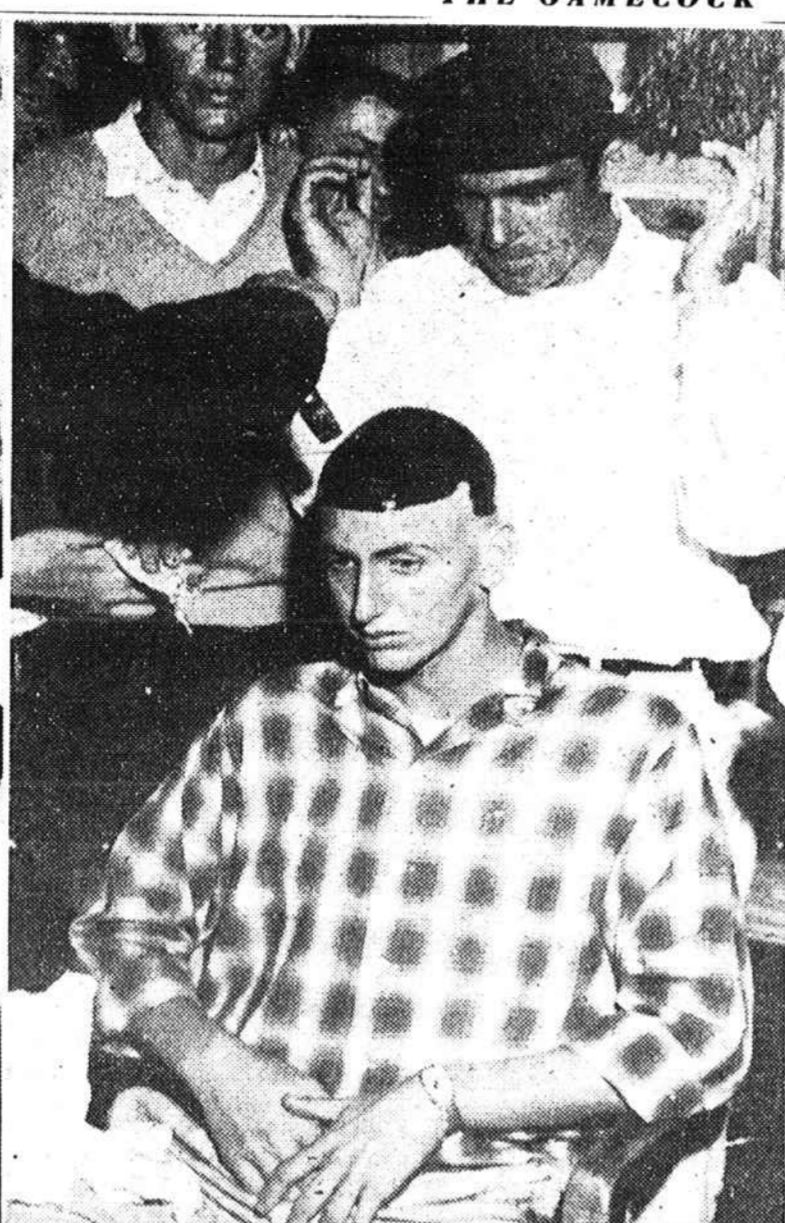
New Clemson hair style . . .