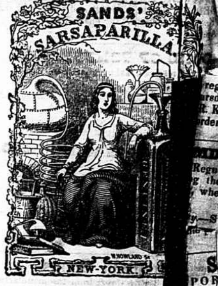
IN QUART BOTTLE FOR PURIFYING THE BLOOD,