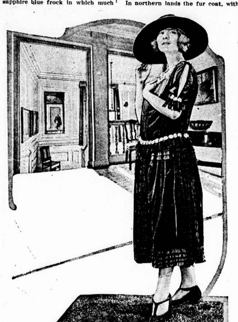
An Unusual and Beautiful Dress

designers who love to elaborate this bits and squirrels along with those romantic fabric with ribbons and of other animals, to wrap the baby up laces, gold or sliver tissue and other in. Tiny girls are going about in embellishments. It lends its-if to fur- smart little coats of fur, or are probelows, but is also charming in the vided with fur-trimmed cloth coats simplest dresses and only the expert and furnished with caps, neckpleces can afford to give fancy a free rein and muffs of fur-and they wear these in the matter of decorative features on luxuries proudly. The "hat to match" idea has proved especially successful, Just how far genfus may go in this used with fur coats or accessories, and direction is set forth by the unusual little ladies are more smartly clad on