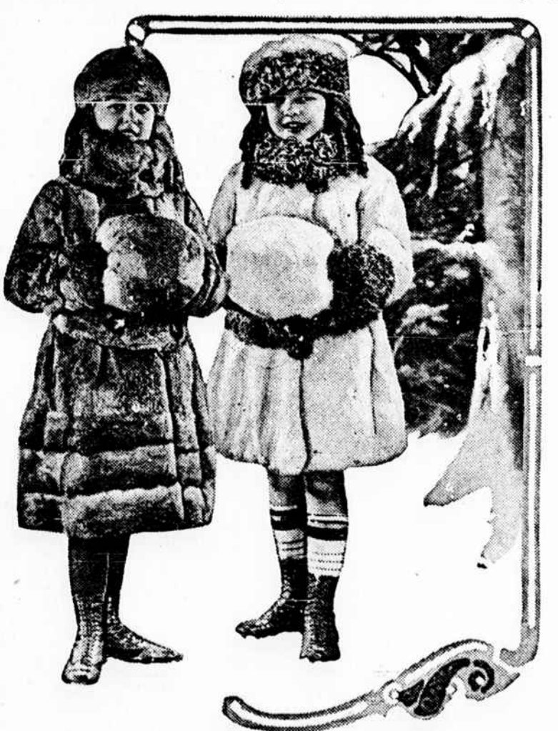
Little Ladies Smartly Clad in Fur

narrow moire ribbon and velvet-cov- | muff and headwear to match, is the ered cord in the same color, silver tis- smartest outfit for midwinter. It is illustrated here by two examples, one and, as is usual in such cases, had in a gem of the designer's art. Its of muskrat, and the other of white held the center of the stage as far as lines are simple, with straight skirt rabbit fur trimmed with krimmer. and bodice. Four panels on the skirt Coats are straight, usually flaring a somewhat puzzled, therefore, when a are made of plaited ribbon, one at the little toward the bottom, with plain back and front and one at each side. coat steeves and wide belts of the fur. Each of these panels consists of three They fasten with a few large buttons narrower panels grouped together and and have high collars, either in the said to him: "What have you got over they are joined at the top and bottom straight band or turnover style, that button snugly about the throat, protecting the lower part of the face. The replied. The straight, long-waisted bodice is coat at the left of the picture, of sleeves, elbow muskrat, shows the advantage of a