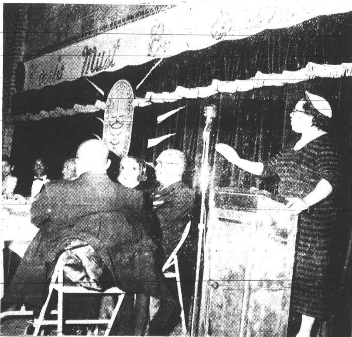
Scene from the $25 Plate Endowment Dinner. The speaker for the occasion was Mrs. Edith Sampson, former delegate to the U. N.