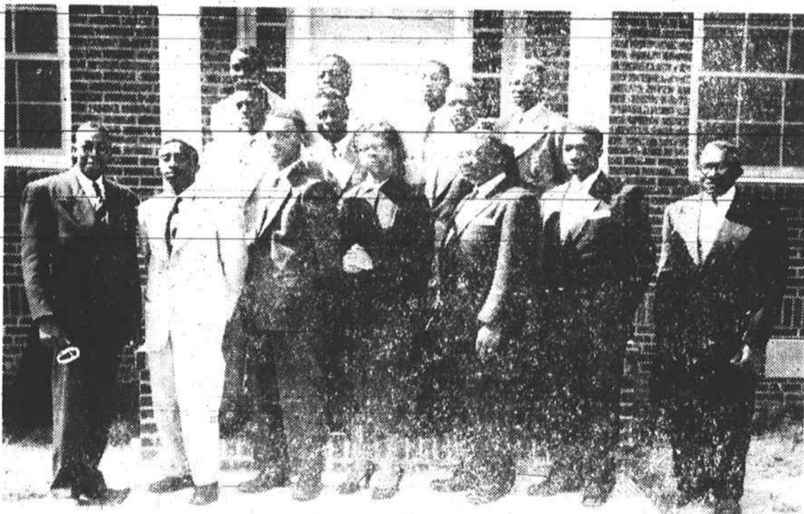
Morris College was founded to train Ministers as well as Teachers. The Theological Department is growing with a strong faculty. The College offers the B. D. degree. Above is a group of persons, (Students) of the Ministerial Department of the College.

MORRIS COLLEGE SUMMER SCHOOL BEGINS JUNE 6. REGISTRATION JUNE 3 AND 4