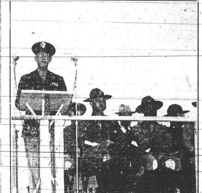
Released by U. S. War Department Bureau of Public Relations FORT CLARK, TEXAS—Lieutenant General Courtney H. Hodges, Commanding General of Third Army, Fort Sam Houston, addressing the men and officers, during the activation ceremony of the 2nd Cavalry Division, Fort Clark, Texas.