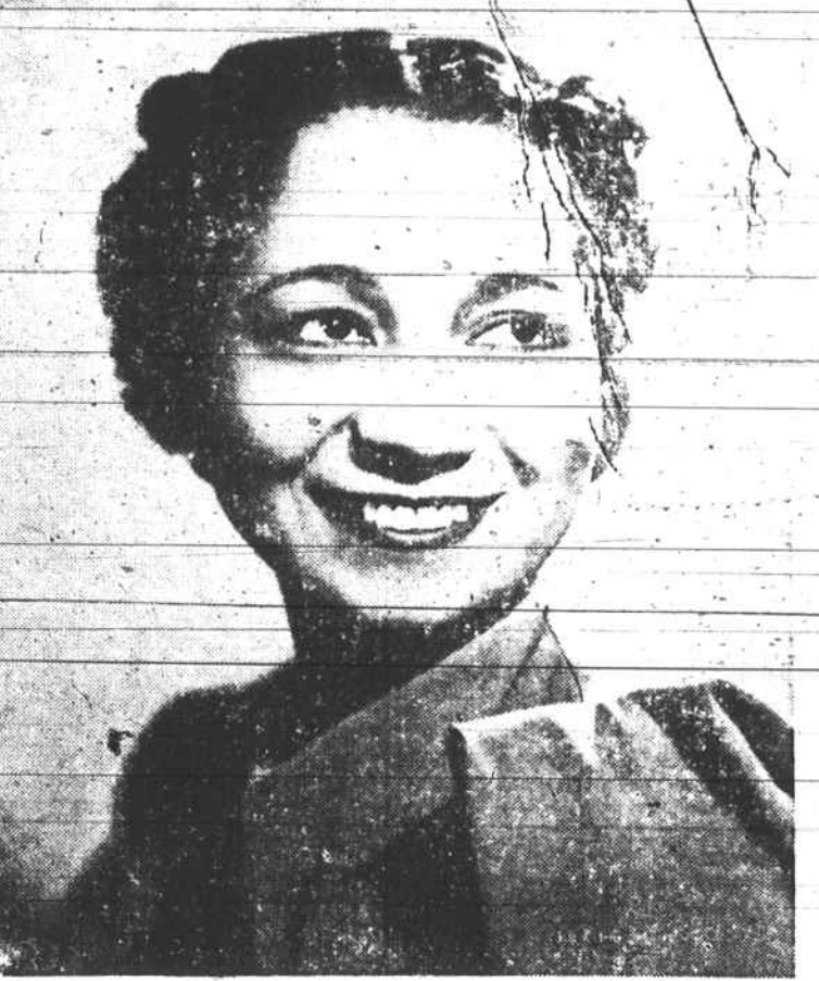
MISS ETTA MOTEN

Concert Celebrity, gave eight concerts in North Carolina last week under the auspices of the North Carolina State Department of Education. The recitals were held at each of the summer schools sponsored by the State. Miss Moten appeared at North Carolina College for Negroes, Durham; Shaw University, Raleigh, State Normal School, Elizabeth City; State Normal School, Fayetteville; Johnson C. Smith University, Charlotte; Livingstone College, Salisbury; A. & T. College, Greensboro and Teachers College of Winston-Salem.