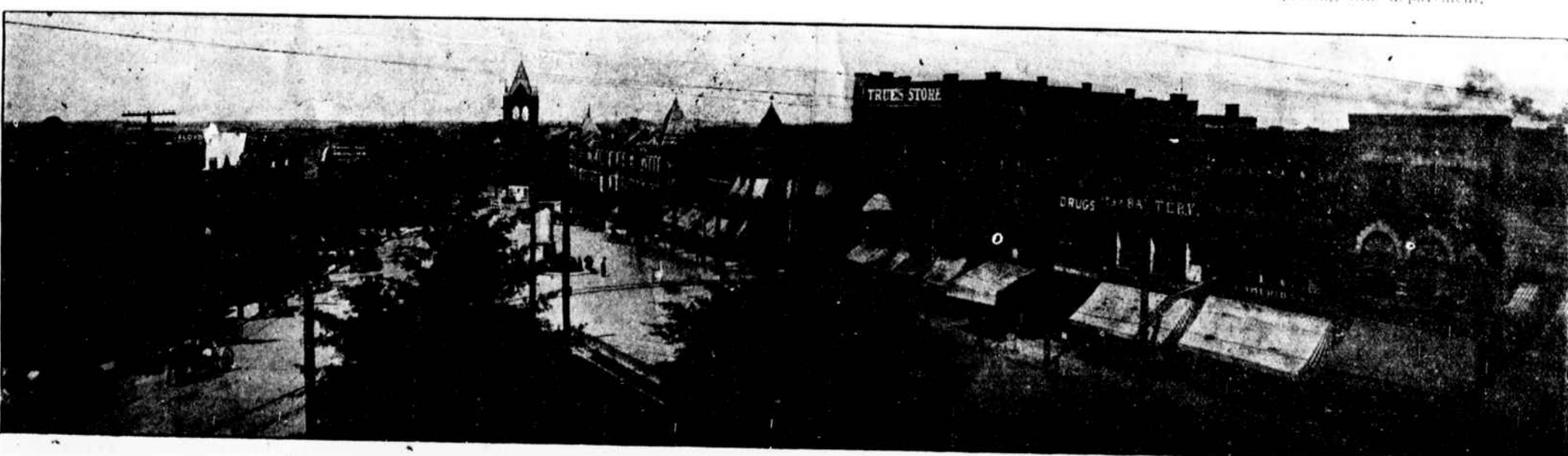
STREET SCENES IN SPARTANBURG.