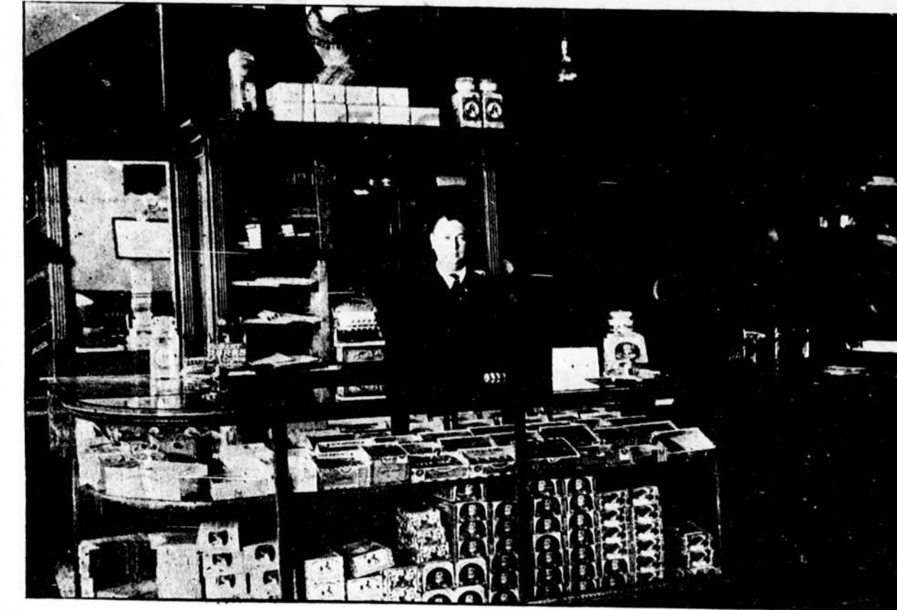
Foreign and domestic Cigars, Cigarettes, and Tobacco. All the late popular Magazines, Newspapers, and Periodicals.