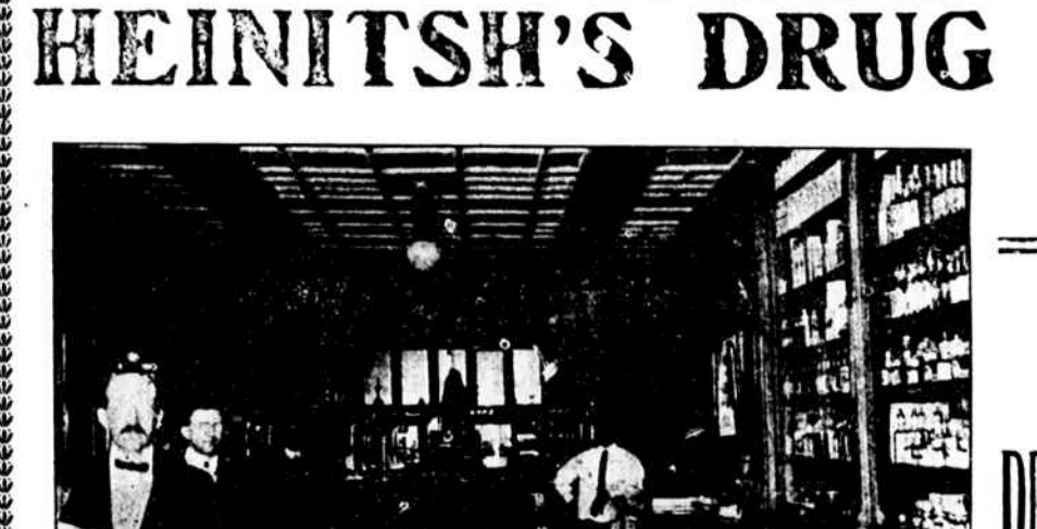
A Full Line of