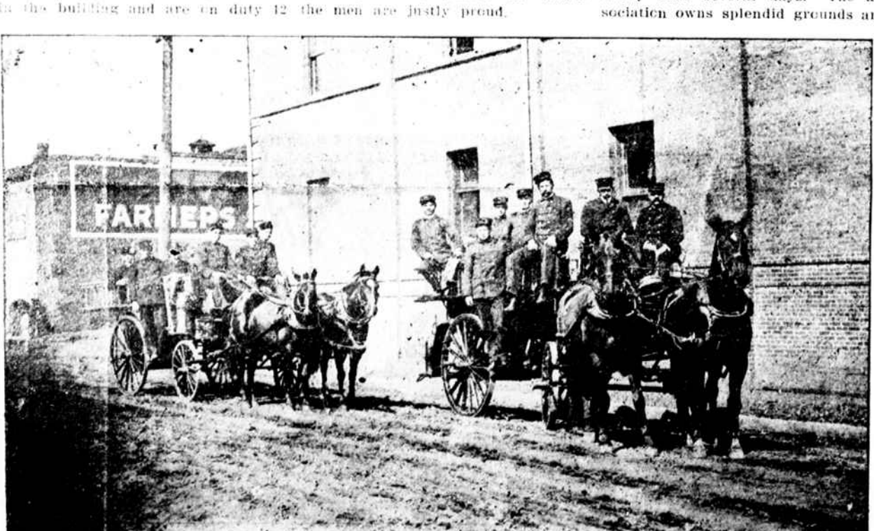
FIRE WAGO NS AND CREWS.

12. In year of the fire house, on dried, while the reels are kept con-