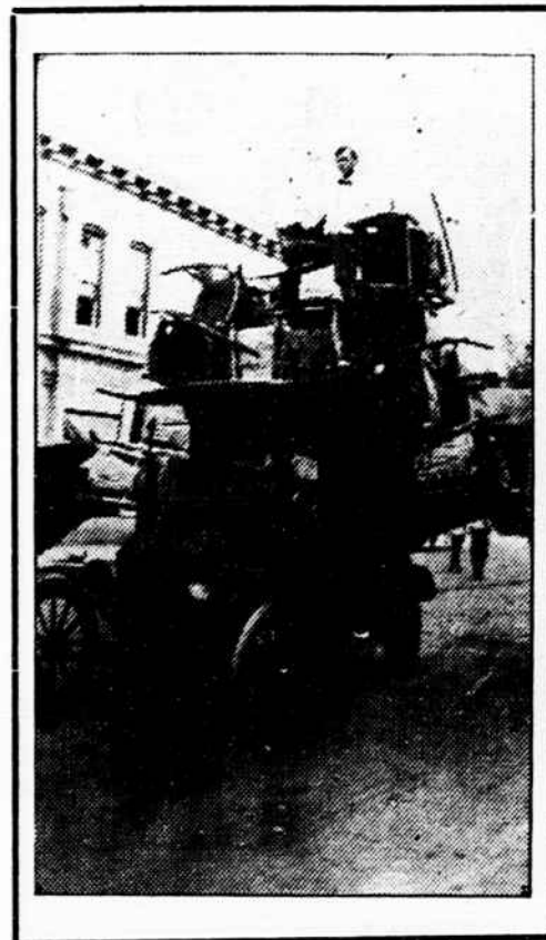
PHOTOGRAPH OF Kingstree Furniture Co's Truck with a Load of Brumby Chairs—the Kind We Guarantee.

Kingstree Furniture Co. 111-113 Academy St., Next to Postoffice. Phone 167.