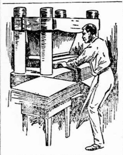
PRESSING THE STAMP SHEETS.

sent to the pressroom. Some of the paper and place them accurately under the press.