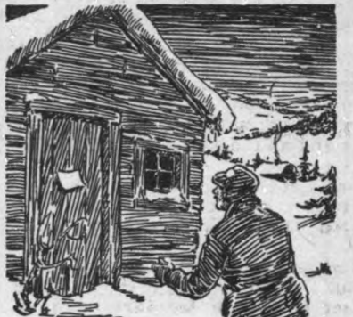
He Noticed Something Like a Card Tacked on Hathway's Door.