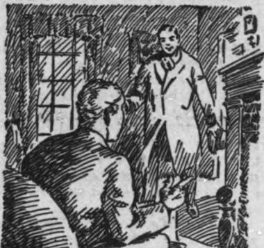
"I'm Sorry, Dad; I Do Appreciate All You've Done for Me."