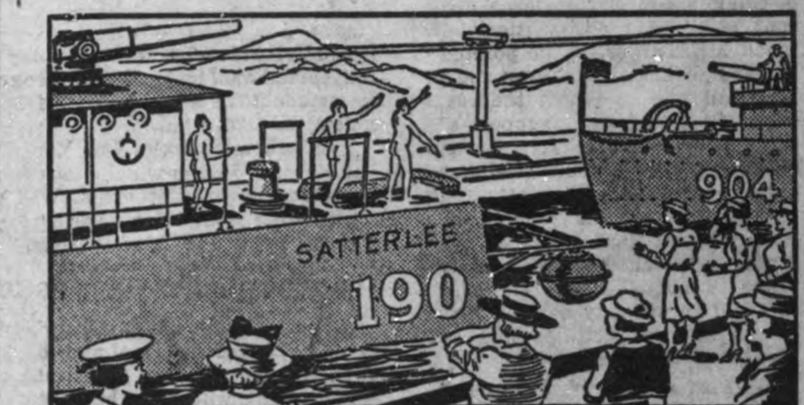
The Soapy Nudists Rushed for the Stern.