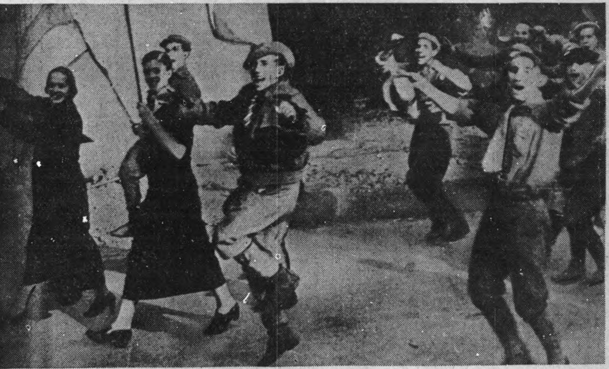
Dancing and singing through the battered streets of Gijon, the Nationalist rebel troops of General Franco are hailed by women of the city as they celebrate their victorious march through the Asturias to capture this important Loyalist stronghold.