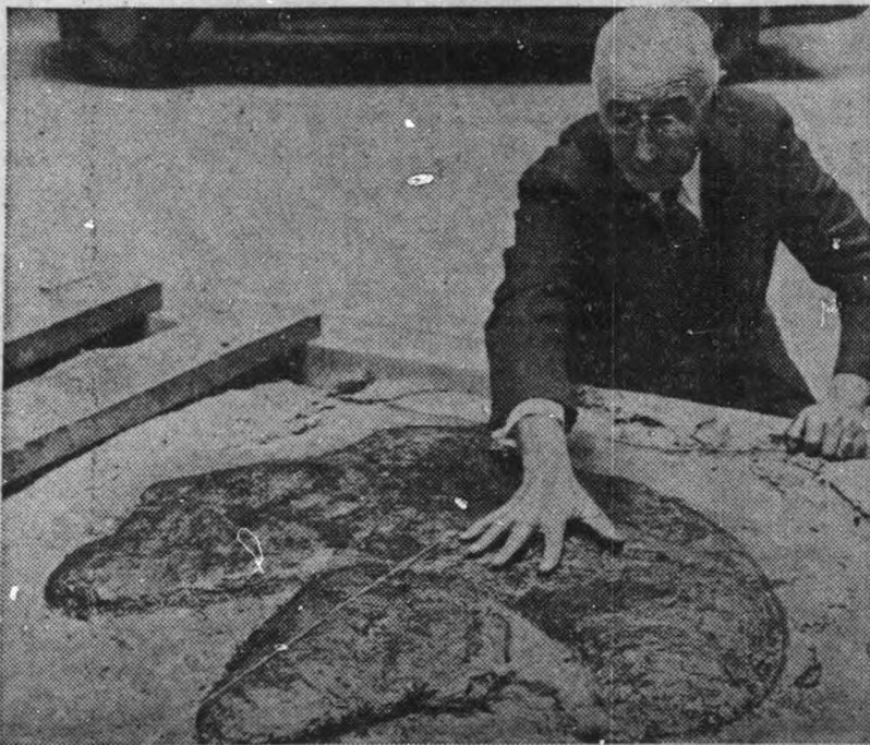
Dr. Barnum Brown, curator of fossil reptiles of the American Museum of Natural History, is pictured with the largest reptile footprint fossil ever discovered. Found in a coal mine near Cedaredge, Colo., on his recent expedition, the footprint of this monster dinosaur, estimated to have lived 80,000,000 years ago, is 34 inches wide and 34 inches long.