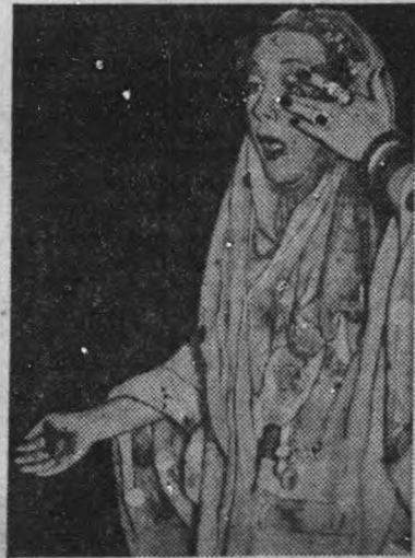
her newest picture. She was playing the role of an unappreciated amateur. Note tomatoes on Miss Swarthout's $2,500 dress which she wore for the scene.

Gladys Swarthout, opera star and actress, wipes tomatoes from her features following a barrage of fruit tossed at her during a scene from