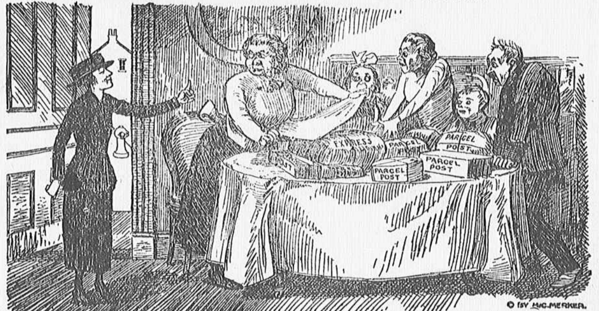
PEGGY: A GUILTY CONSCIENCE NEEDS NO ACCUSER. SHAME, FEAR, DECEIT, AND A GUILTY CONSCIENCE ARE ALL WRAPPED UP IN THOSE OUT-OF-TOWN PACKAGES.