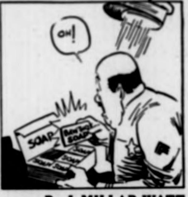
By J. MILLAR WATT