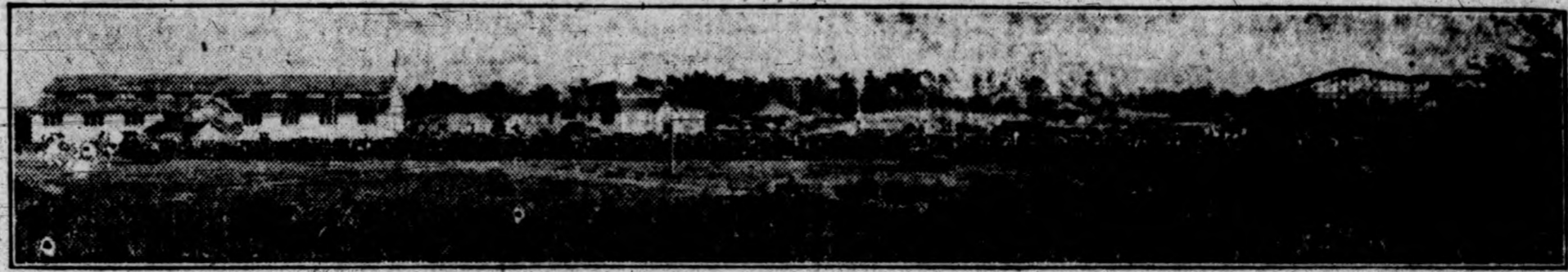
Automobiles by the thousands were parked at the Georgia State Fair grounds last year with the least confusion and annoyance to patrons. Ample police protection, assistance of Boy Scouts in directing traffic and vigilance of official fair committees, encouraged automobile attendance. Being on the South Atlantic Coastal Highway, the fair grounds are accessible by easy travel. The view shows several thousand cars parked so that any can leave immediately. To the left and center are the principal exhibit buildings, in the middle are the tented attractions; and to the right is the $12,000 roller coaster erected last season. This year the fair will open October 26 and close October 31.