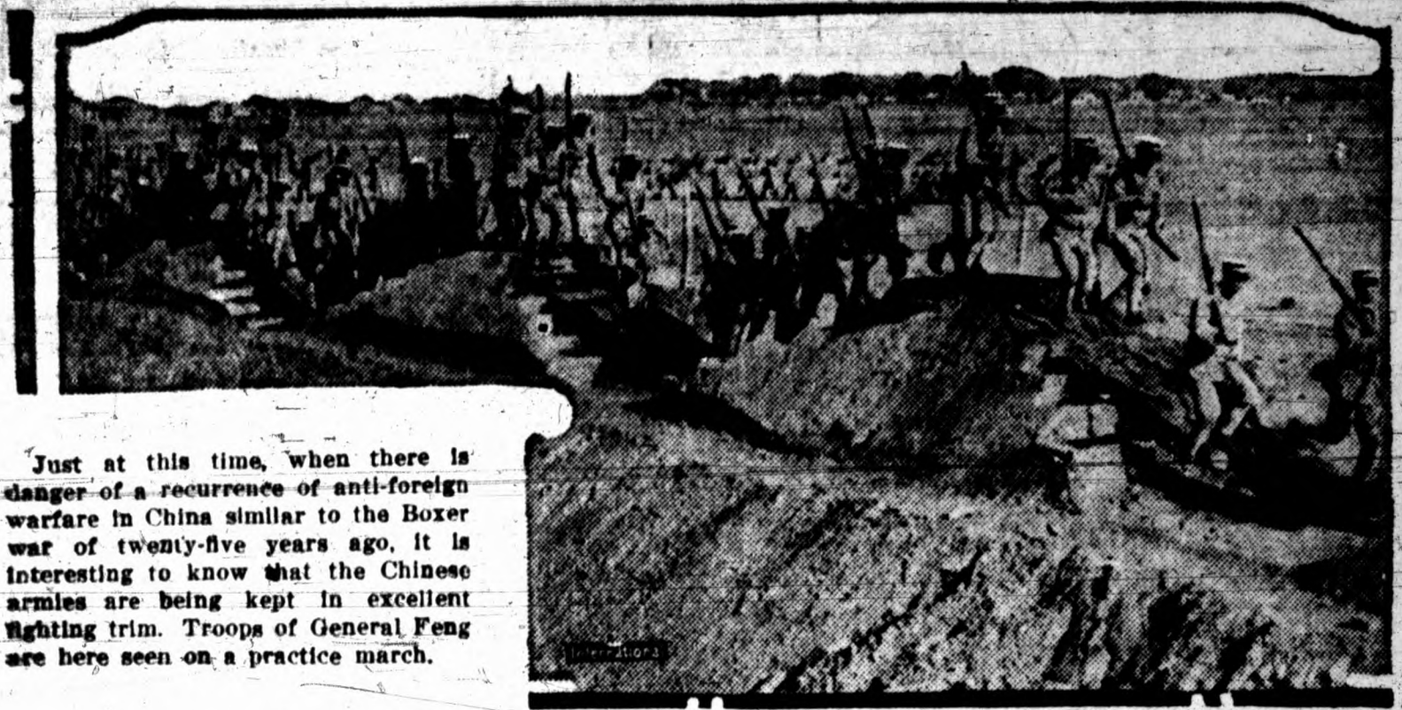
Just at this time, when there is danger of a recurrence of anti-foreign warfare in China similar to the Boxer war of twenty-five years ago, it is interesting to know that the Chinese armies are being kept in excellent fighting trim. Troops of General Feng are here seen on a practice march.