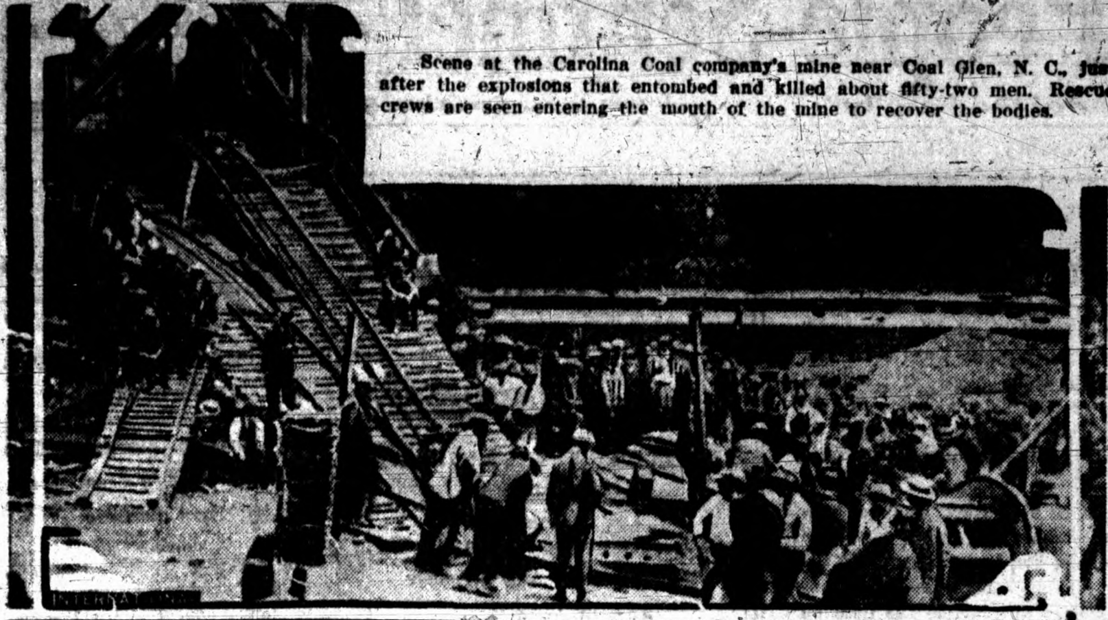
Scene at the Carolina Coal company's mine near Coal Glen, N. C. just after the explosions that entombed and killed about fifty-two men. Rescue crews are seen entering the mouth of the mine to recover the bodies.