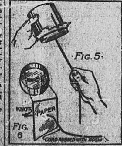
Figure 5 shows the idea adapted to a try that is quickly put together. Get an empty tia can, a piece of heavy wrapping paper, a piece of stout wrapping twine, and a piece of rosin. Double the wrapping paper, pierce a hole through its center, stick the end of the card through it and tie a large knot on it (Fig. 6). Then tie the paper over the open end of the can, as shown in Fig. 8, and trim off the projecting eiges. To operate, puli firmly on the viring, at the came time allowing it to slide through your hand. (Copyright by A. Noots Hall.)

If you have never tried pulling upon a string rubbed with resin, you cannot appreciate what a loud shricking sound is produced in this manner.