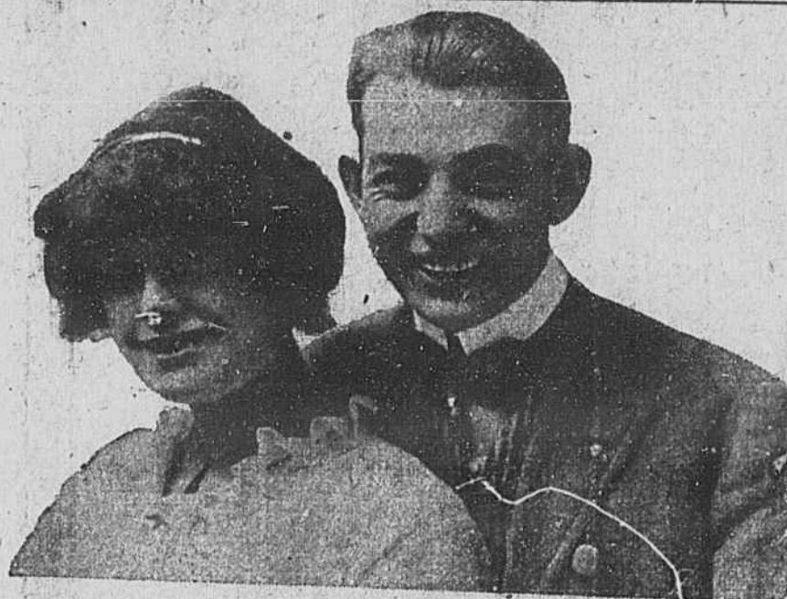
THE TWO GUNNS

At 8 o'clock you're smiling; at 8:15 you're laughing; at 8:30 you're still laughing, and at 9 o'clock you feel that you've seen a Dollar Show for 10c and 15c.