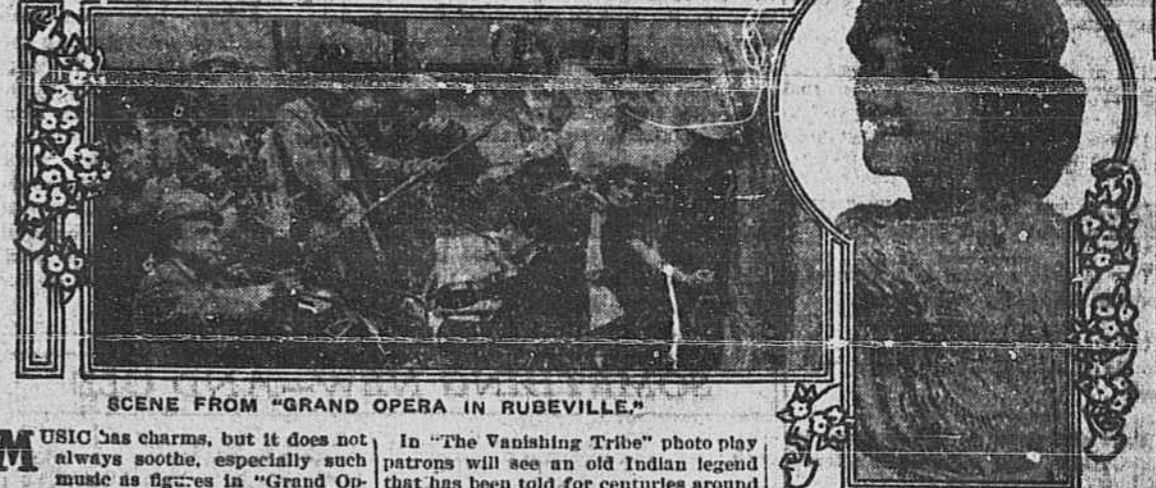
SCENE FROM "GRAND OPERA IN RUBEVILLE."

MUSIC has charms, but it does not always soothe, especially such music as figures in "Grand Opera in Rubeville." The play tells the story of the efforts of a city musician to present "The Bohemian Girl" in a small town with local talent and the town belle. He might have succeeded if his record had not been looked up.